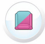
good but beware