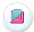
good but beware