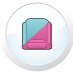
good but beware