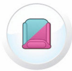
good but beware