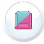
good but beware