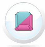
good but beware