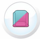
good but beware