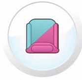
good but beware