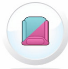
good but beware